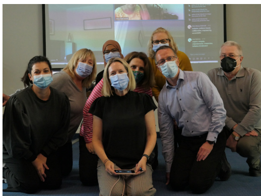
SAFE and members worked together to develop the 2024-2028 strategy