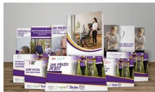
We published 'Surviving Stroke', which is an evidence-based information pack for families and stroke survivors and translated into 12 European languages.

Thank you to the Stroke Association for providing us with the original brochures in English.